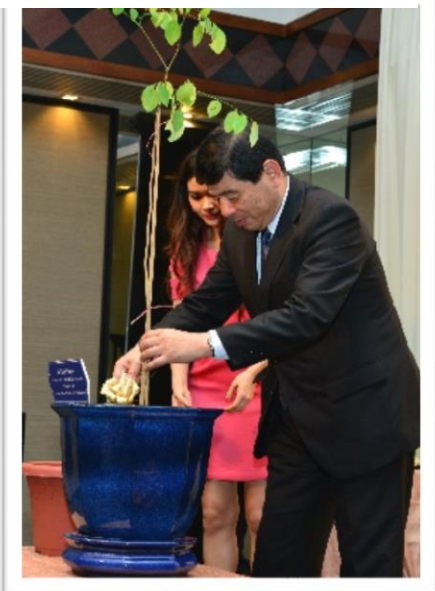
ROCB tree in Nov. 2014